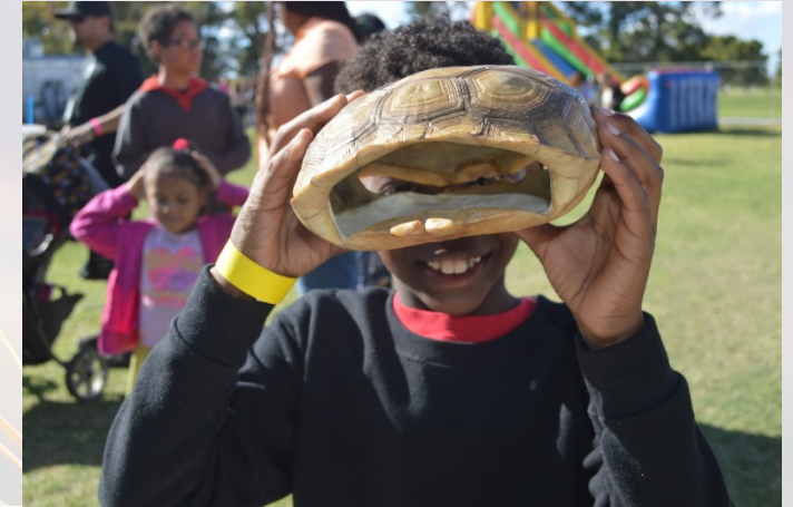
Pigs for the Kids Charity BBQ

Pinwheels for Prevention – Galleria Mall